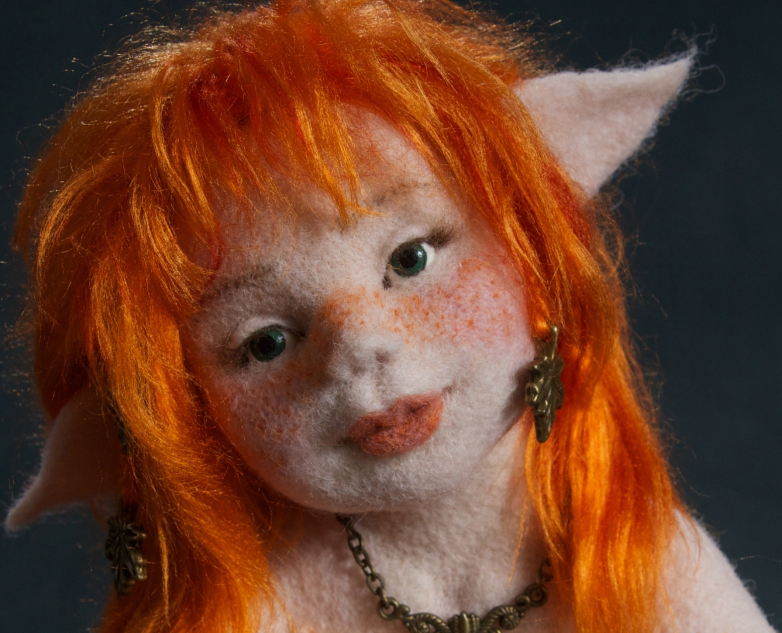
For toning (colour modification) of my dolls' faces, I use colour wool while for eyes hands painting acrylic colours and acrylic lacquer are used.