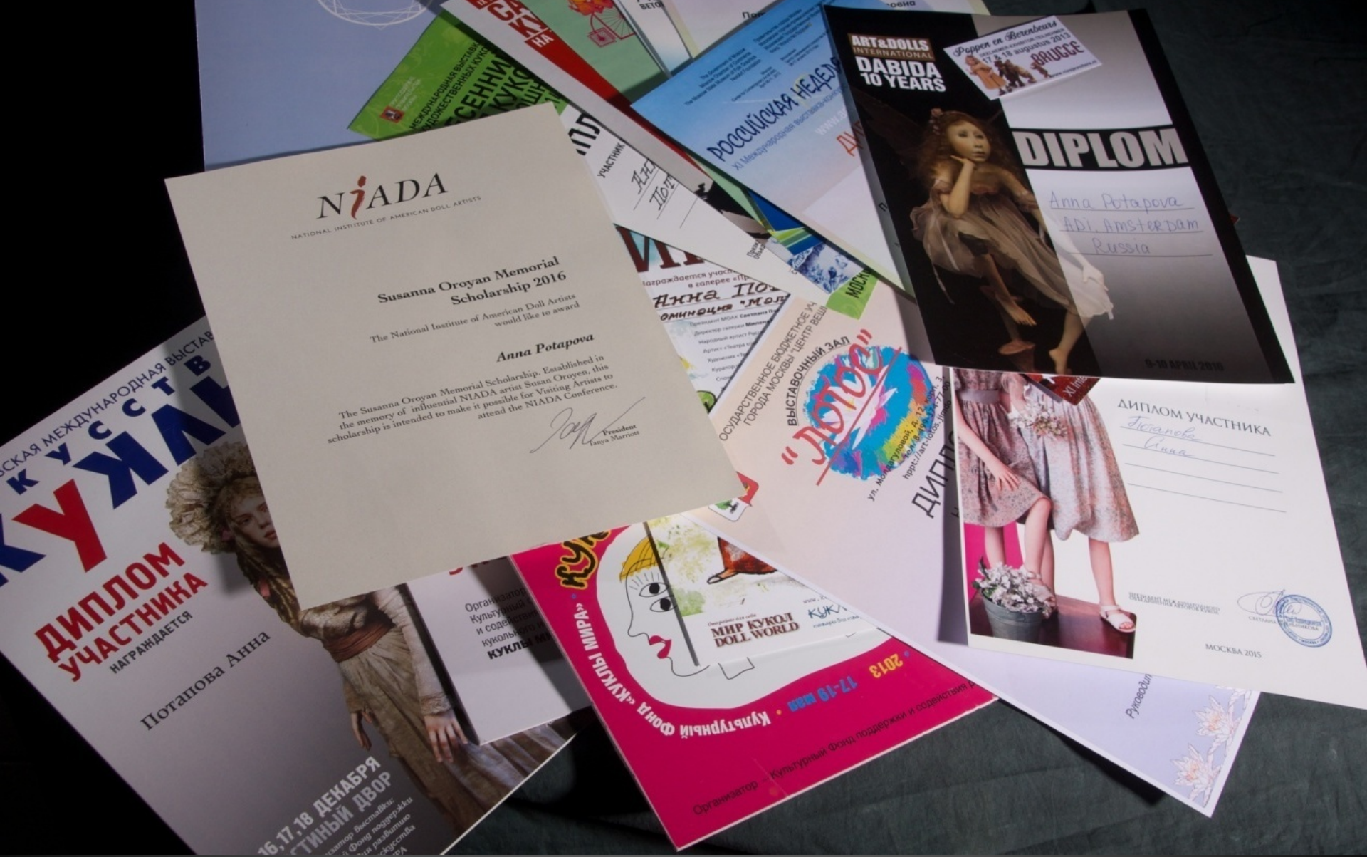
I participate in the international exhibitions held in Russia and abroad: The Art dolls (Moscow), The Dolls Salon in Tishinka (Moscow), The Doll and teddy bear show in Belgium (Brugge), The Puppet show DABIDA (Amsterdam), The Biennale design of dolls and toys (Moscow), The Doll and teddy bear show (Nizhny Novgorod), Christmas exhibition at the castle Nogeboyde (Vienna) and other. In 2016, I was on NIADA conference as a guest artist.